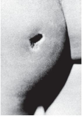
This child was injected with a needle that was not clean enough. The dirty needle caused an infected abscess (pocket of pus) that burst. The child had been injected for a cold. It would have been better to give him no medicine at all.

When used correctly, certain injected medicines, like some vaccinations, are important to protect a child's health and prevent disability. However, giving injections with an unclean needle or syringe is a common cause of infection and can pass the germs that spread HIV and other serious diseases like hepatitis (see Where There Is No Doctor , pages 399 to 401, and 172).