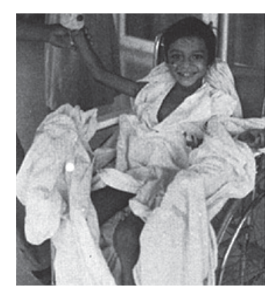
Nicaraguan child disabled by a 'Contra' bomb. The Contras were rebel troops supported by the US government to overthrow the popular government in Nicaragua.

In the past decade, millions of children have died in wars, and at least 6 million have been injured or disabled. Children, especially boys, are sometimes forced to fight as soldiers, and many are either killed or injured and disabled. Girls are sometimes also forced to be "sex-slaves" for soldiers. Not only are these children disabled physically, but their mental health is also badly affected.