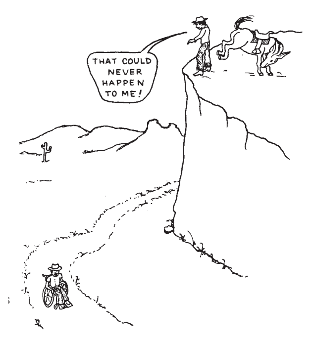
Disability can affect everybody, and sometime in our lives it usually does.

Those who are most concerned about disability are usually disabled persons themselves and their families. Based on this concern, they can become leaders and community educators for disability prevention.